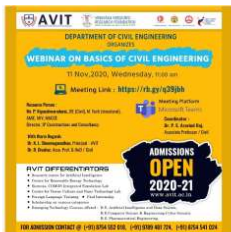
E-invitation for the program